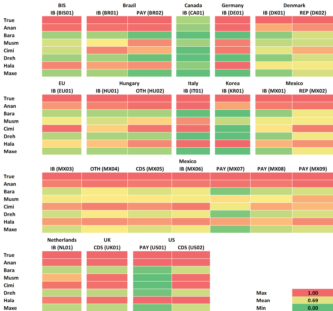
Figure 5: Percentage of true non-links

Note: true-non links are defined as the percentage of absent links also not present in the reconstructed network. The cells are shaded according to the relative true-links ranging from green to red.