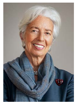
Christine Lagarde, Chair of the European Systemic Risk Board

This ninth ESRB Annual Report covers the year from 1 April 2019 to 31 March 2020. While that period includes the early onset of the coronavirus (COVID-19) pandemic, the economic and financial consequences of the COVID-19 crisis have continued to evolve rapidly in subsequent months. For that reason, this year's Annual Report includes – exceptionally – the ESRB's assessment of risks up to June 2020, so as to reflect the new systemic risks that have emerged as the European economy has endured this extraordinary macroeconomic shock.